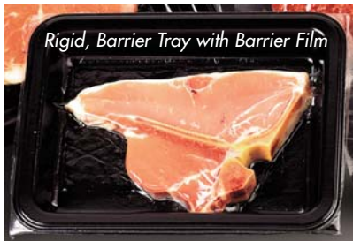
Rigid, Barrier Tray with Barrier Film