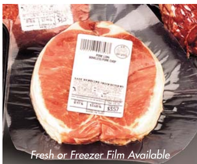
Fresh or Freezer Film Available

The packaging flexibility and high end look you desire at a fraction of the cost of rollstock