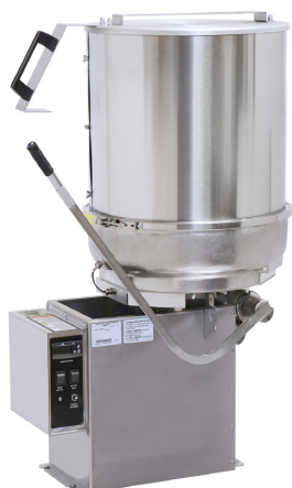
Mark 10, LH Dump