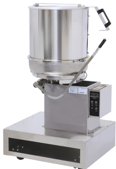
Mark 10, RH Dump, shown on 2436-001 Base for reference only (base sold separately).