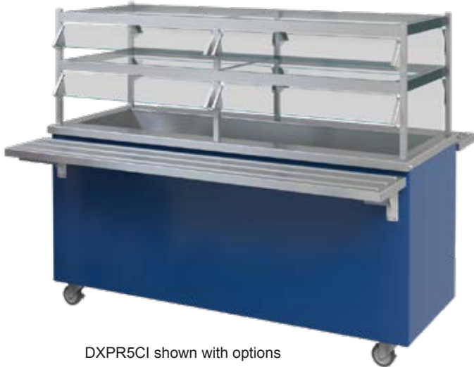
DXPR5CI shown with options

Dinex Cold Food Units are available mechanically cooled (DXRCM) or ice only (DXRCI). These units are designed to serve a variety of refrigerated food products and are ideal as a salad bar merchandiser. The versatile modular design allows you either a cafeteria or a buffet unit to fit your line-up. Units are compatible and will interlock with other Mobile Serving Cart units.