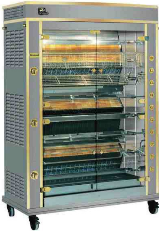
GF1375-8 Gas + Roof + Base Cabinet SSP: Stainless steel with brass trim

Rotisol's GrandFlame Rotisserie Ovens epitomize beauty and functionality, featuring a unique cooking system. Visible flames & elegant finishes provide atmosphere, quality & design provide dependability and spit options and accessories allow for increased diversity.