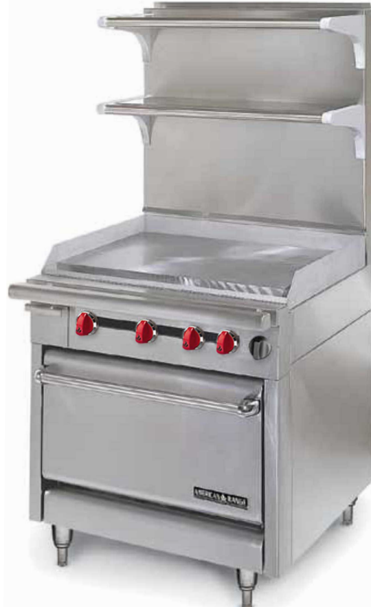
Model Shown HD36-36TG-I